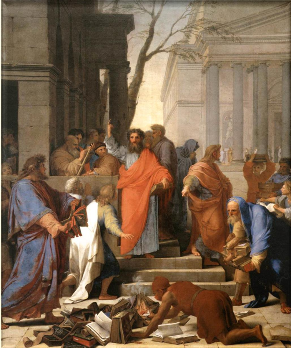
The Preaching of St Paul at Ephesus By Eustache Le Sueur