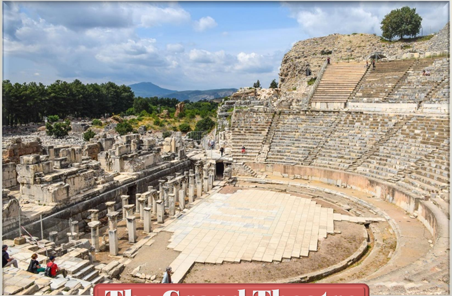
The Grand Theatre