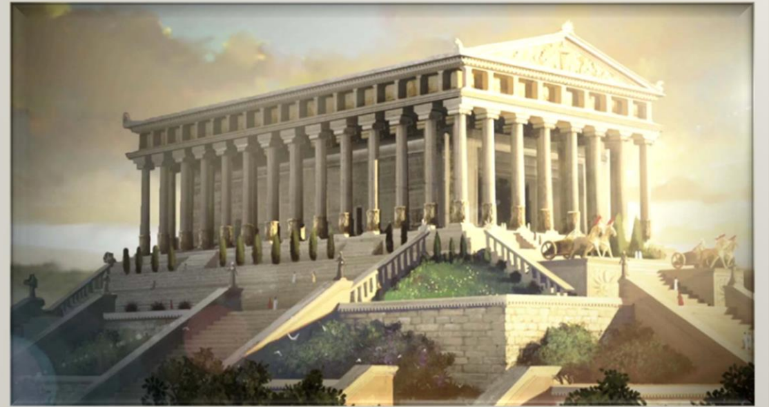
Temple of Artemis