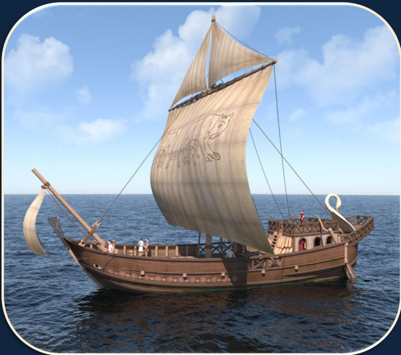
Roman Corbita Ship