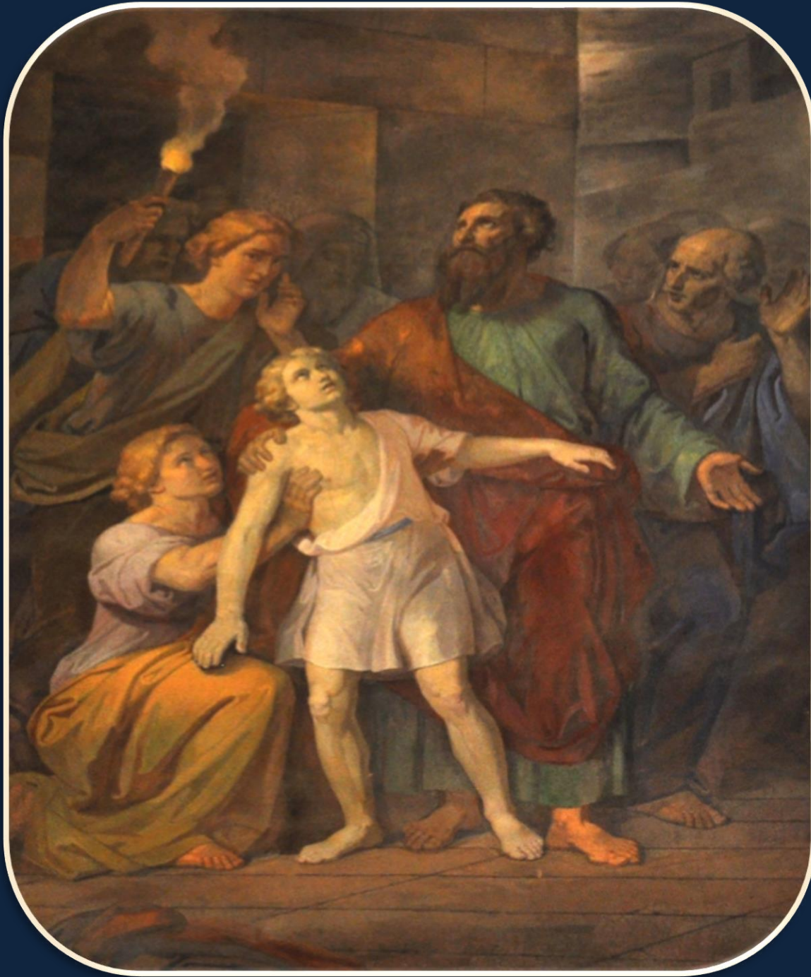
Paul Revives Eutychus Oil on Canvas St. Paul's Basilica, Rome