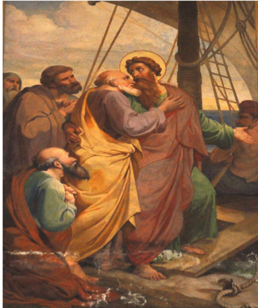
Paul Leaves Miletus Basilica of St. Paul