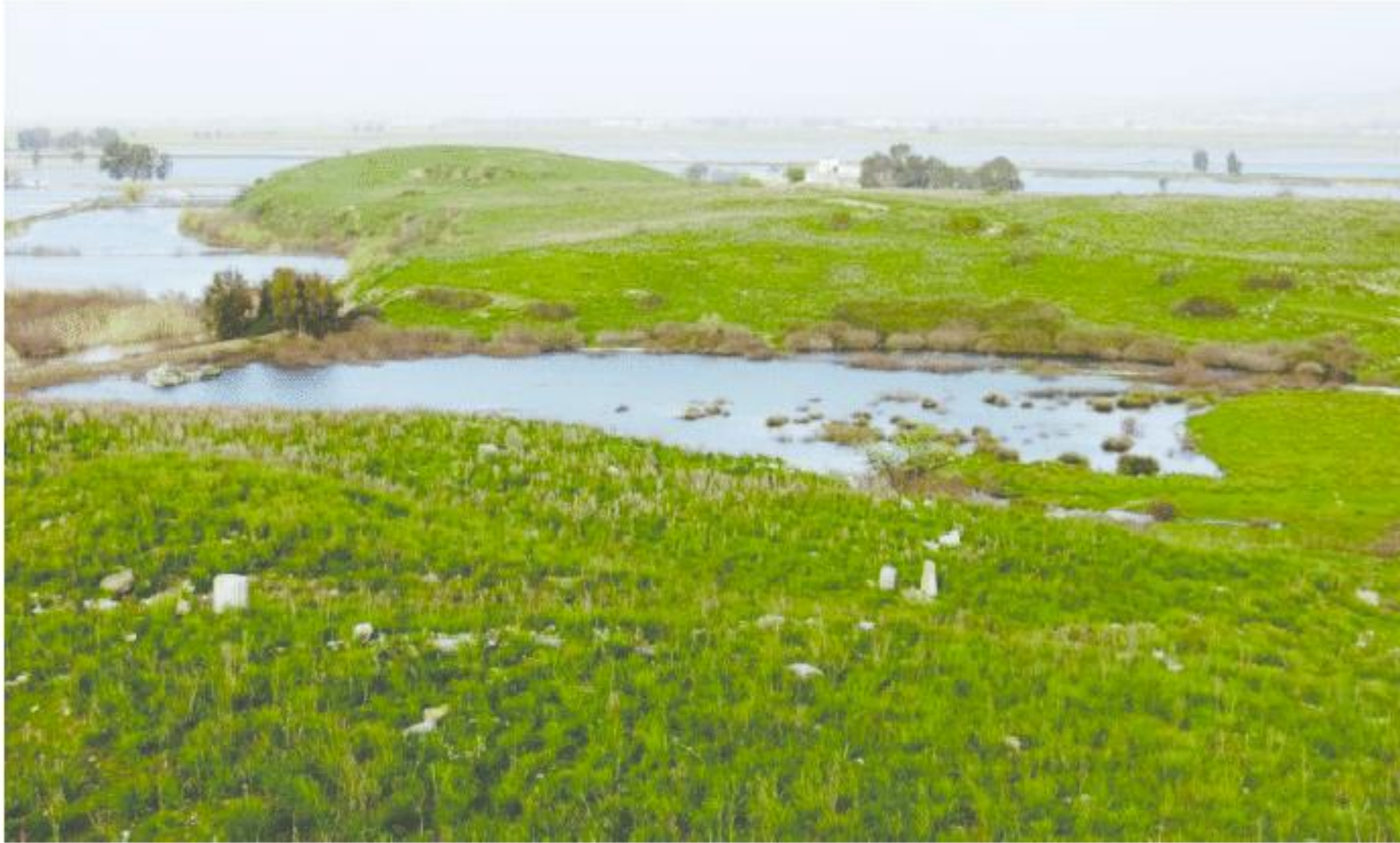
Harbor in Miletus